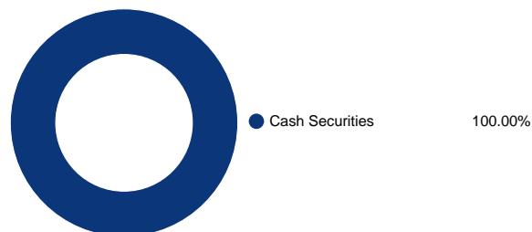
31 October 2018