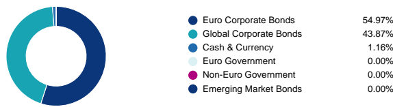
31 January 2026