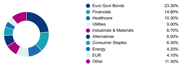
31 January 2026