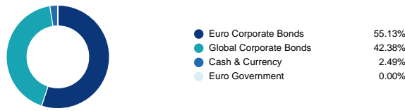
30 June 2024