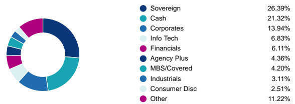
31 March 2026