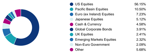
31 March 2026