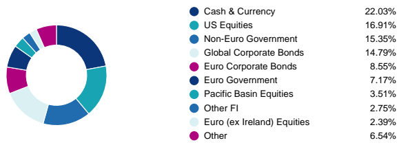
31 March 2026