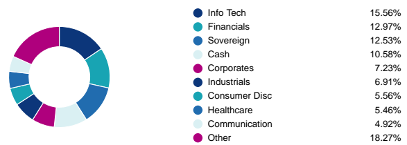
31 March 2026